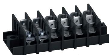
Series 307-PCM Assembly with screw contact and 6 contact tab configuration