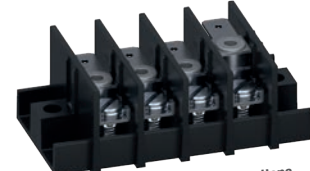
Series 3070 With two different tab configurations and SAK screw connection