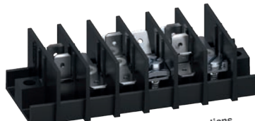
Series 307-PCM Different assembly with screw connections