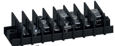
Series 3070-PCM Configurations with 2- and 3-layer tabs and SAK screw connection