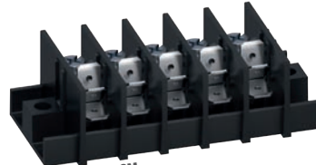
Series 307-PCM Screw connection and tab in 0°, 45° and 90° design