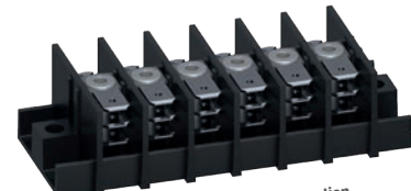
Series 3070-PCM 3-layer tab 4.8 mm and screw connection