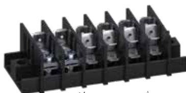
Series 307-PCM Assembly with screw contact and 6 contact tab configuration