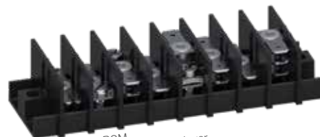
Series 3070-PCM Configurations with 2- and 3-layer tabs and SAK screw connection