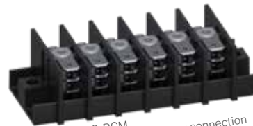
Series 3070-PCM 3-layer tab 4.8 mm and screw connection