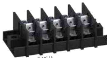
Series 307-PCM Screw connection and tab in 0°, 45° and 90° design