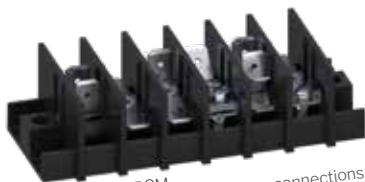
Series 307-PCM Different assembly with screw connections