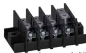
Series 3070 With two different tab configurations and SAK screw connection