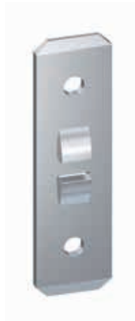
6.3 6.3 mm Flat connector