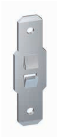
4.8 4.8 mm Flat connector