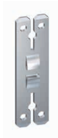
XBS 2x 2.8 mm / 1x 6.3 mm Flat connector